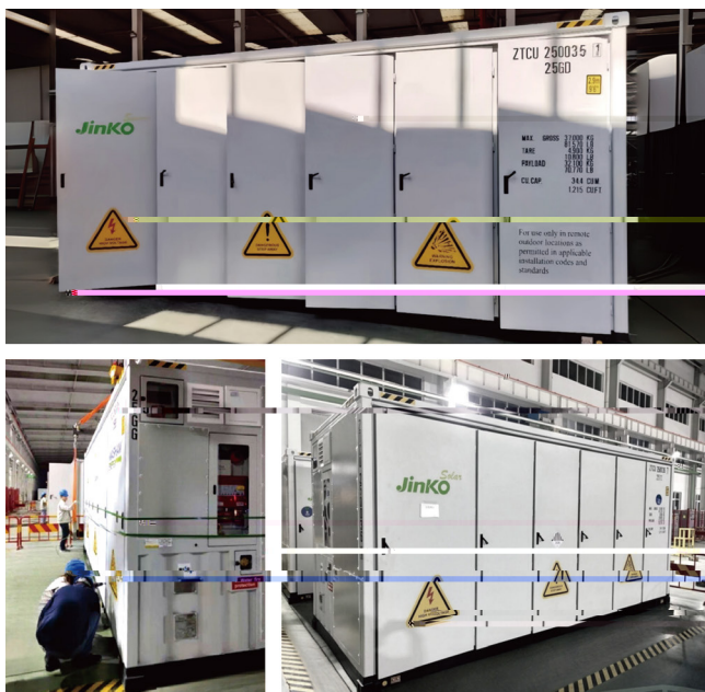
Figure 1: Project Photos

For the global energy storage system (ESS) market, JinkoSolar promotes UL, IEC, and regional-specific certified products such as battery cells, modules, packs, racks, and DC battery blocks. For the DC side market, JinkoSolar's most popular offerings are the fully integrated 20-foot DC battery container block solutions that come in 2 variants – the air-cooled version at 1.5MWh and the liquid-cooled version at 3.4 MWh.